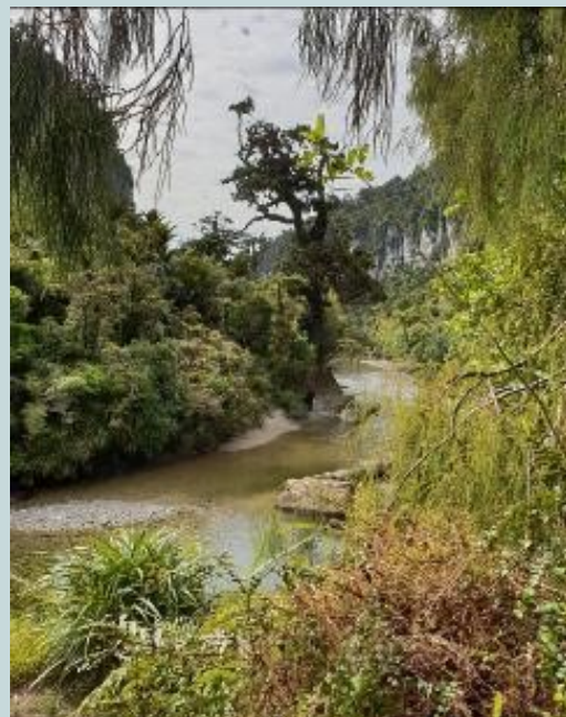
Responsible Care is tailored to meet the needs of a small country with no major chemical manufacturing but has a heavy user base and a unique environment that needs safeguarding

Recruitment is an ongoing challenge and despite best efforts, he regrets poor participation in RCNZ on the part of several multinational companies doing