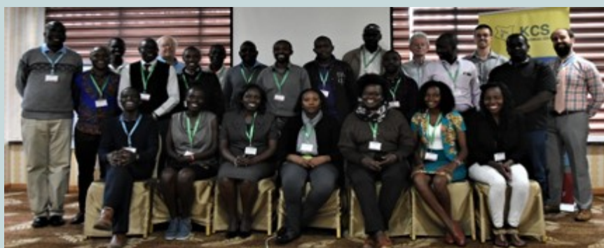
Participants from the Sandia/Kenya Chemical Society workshop

◆ A representative of the Angolan government expressed interest in RC after a meeting in Doha in late October. The Director General of the Instituto Nacional de Inovacao E Tecnologias Industriais, part of the Ministry of Industry, is seeking to form a chemical industry association and to promote RC in the country. Portugal's chemicals association APQuimica has agreed to support Cefic in gathering relevant information to help the Portuguese-speaking country move forward with plans.