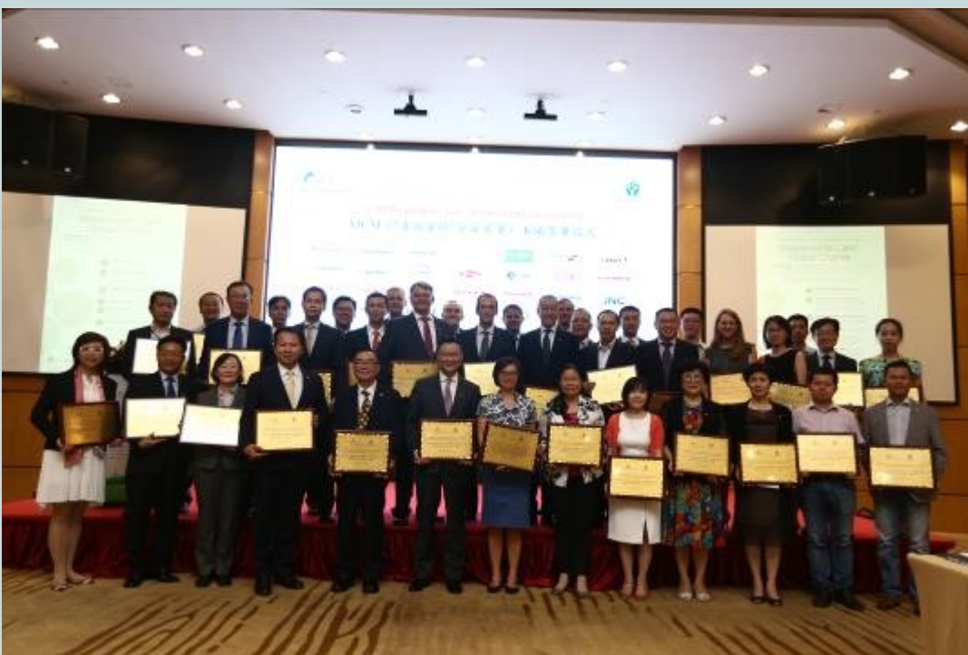
The proud group of AICM Global Charter signatories

OPEN-TO-PUBLIC PARTICIPATING COMPANIES Air Liquide, Arkema, AkzoNobel, Allnex, Ashland, BASF, Cabot, Celanese, Clariant, Covestro, Dow, DSM, Eastman, Evonik, Henkel, Ingevity, Kemira, Linde, LANXESS, Mitsubishi, Merck, Methanex, PPG, SABIC, Solvay, Topsafe, Trinseo, Wacker